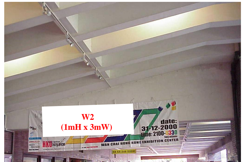
Ceiling Banner of the Run Run Shaw Podium