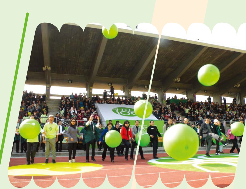
The guests, Vice-Chancellor and student representatives release a bunch of bright green balloons to start the ceremony.

January 9 was a cheerful day for HKU, as the Centenary Celebrations began. More than 1,000 spectators and 1,500 participants gathered at the Stanley Ho Sports Centre to celebrate the big event. Students, graduates and staff from all departments and faculties formed the parade, and were helped along by a sterling performance from the Hong Kong Police Band. The participants dressed up in different costumes and held different flags and souvenirs to announce their loyalty to the University and catch some attention in a colourful event. There was a great carnival atmosphere with people waving, having fun and plenty of smiles on faces. Before the ceremony began, there were food stalls, social enterprise booths and a children's art section. The celebrations ended with a historic photo session of all the participants in the ceremony, with everyone shouting the slogan: "HKU, HKU, HKU, 100!"