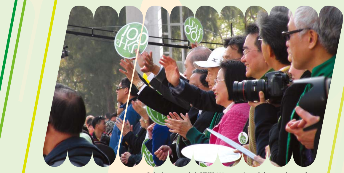
Onlookers wave their HKU 100 souvenirs and cheer on the parade.

The parade participants smile and celebrate.