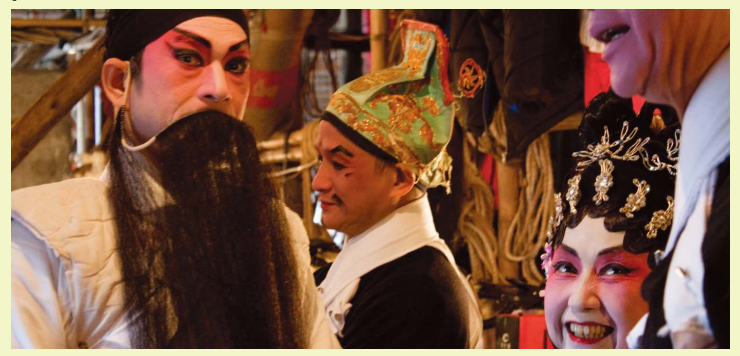
Cantonese opera is a traditional form of opera performed in the Guangdong region of China. Here, performers from a local troupe share a light moment backstage after they have put on their make-up and are preparing to put on costumes.

Fishermen living in the seaside villages enjoy Cantonese opera, which is performed in celebration of the birth of the goddess of the sea.