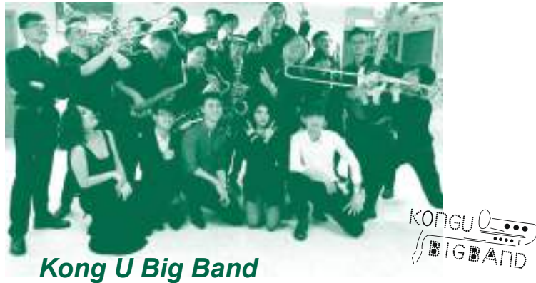
Kong U Big Band

Established in 2014, Kong U Big Band is the first big band based in The University in Hong Kong. The band has performed in a variety of events, including HKU's high table dinners, street shows, and held a successful joint concert with Hong Kong Doujin Philharmonia in Tsuen Wan Town Hall last year. As the band seeks to expand, it is actively looking for new members. It welcomes anybody with a passion in jazz music to join them in this musical endeavour.