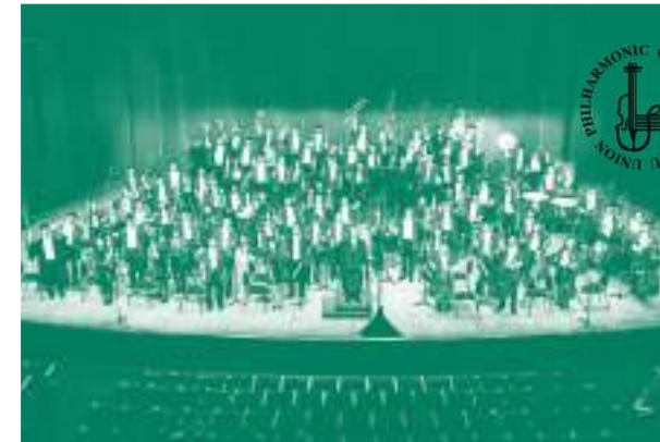
Union Philharmonic Orchestra, HKUSU

The Union Philharmonic Orchestra (UPO), HKUSU was founded in 1999 by a group of devoted students of the University of Hong Kong. The Orchestra aims at developing student's interest in western music and strives to develop an atmosphere of music appreciation within the University and throughout the community. The Orchestra prides itself on being solely formed by HKU alumni, staff and students. It organises a Spring Concert in April and the Annual Performance in November as yearly tradition.