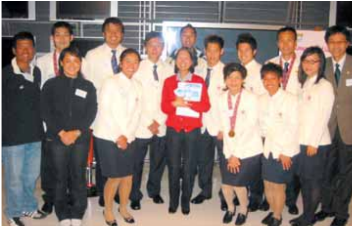
The HKU representatives in Asian Games

The University of Hong Kong shares the joyous moment and congratulates the record achievements of delegates from HKU and her alumni in the 15th Doha Asian Games in December 2006. HKU will continue to nurture the talents of the students and emphasise the importance of their holistic development.